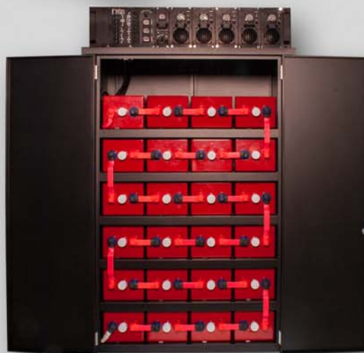
MNB17-5 & Battery Box