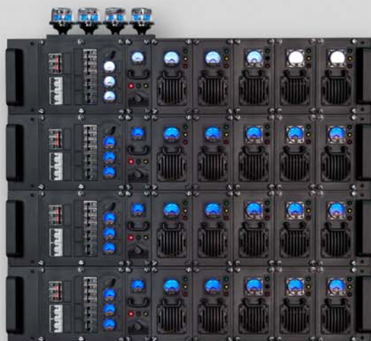
MNB17-5 Four Stack